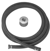
FP2735 Suction Hose Kit