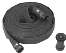
FP2731 Discharge Hose Kit